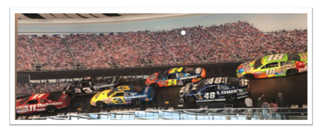
NASCAR Hall of Fame