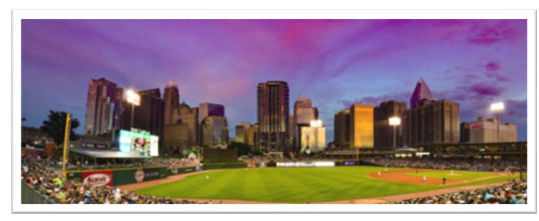
Charlotte Knights Minor League Baseball