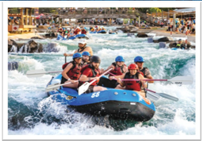
Charlotte Whitewater Outdoor Center