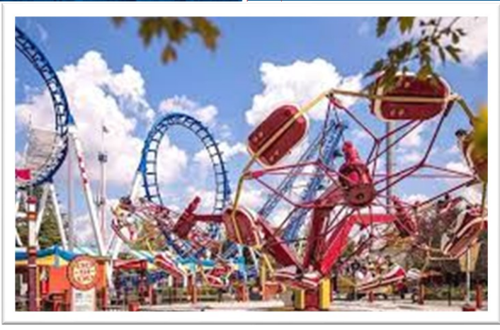
Carowinds Amusement Park